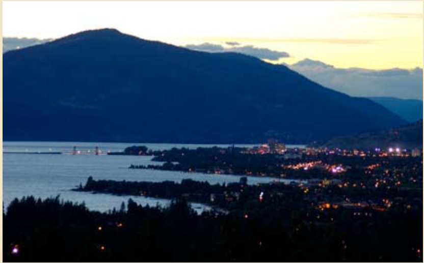
Lake views stretch across the lake from this hilltop home in The Quarry.

3,550 SQ. FT. EXECUTIVE HOME OFFERS VALUE WITHOUT SACRIFICING QUALITY