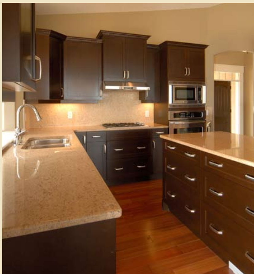
Professional, high-end appliances round out the spacious kitchen.

Views of the lake reach through the home to the Great Room, kitchen and dining area but they will be best enjoyed from a large covered upper deck that has the unique plus of two entries. One entry provides access from the master bedroom and the other from the open kitchen.