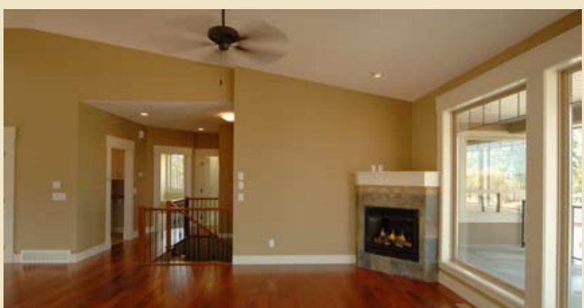
Beautiful Brazillian cherry floors and vaulted ceilings open up the main floor.

At the rear, a private backyard has been created on the gently sloping site in two tiers. Because the new owner may desire a backyard pool, Reese has left the rear yard in a virgin state but devised a complete landscaping package option as an alternative for only $14,000.